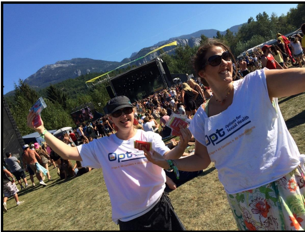
Our Squamish Opt Clinic Staff and Volunteers attended the Squamish Music Festival and made sure festival attendees had condoms and lube, as well as info about Opt!

I continue to be exceedingly proud of everyone within the Opt community. It is through the commitment and dedication of all Opt staff, volunteers, donors, members, and partners that we strive to achieve our mission and ensure healthy sexuality for all British Columbians. Thank you for all that you do to support Opt.